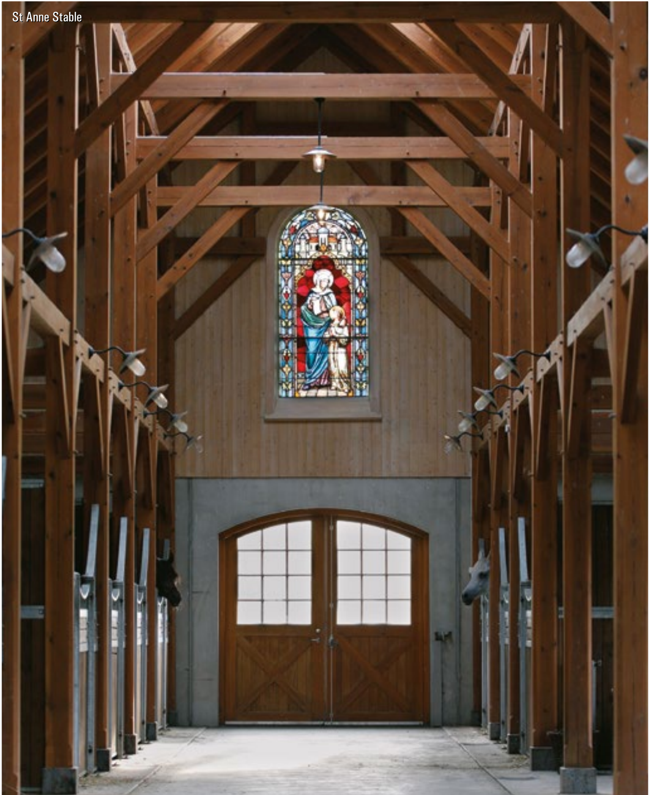
St Anne Stable